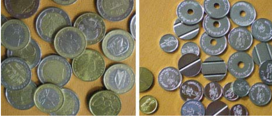
This coin system processes up to eight different Euro coins as well as two different tokens.